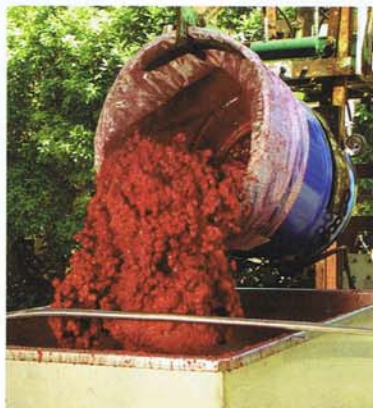
On dumping day, the raspberries are poured into large vats.